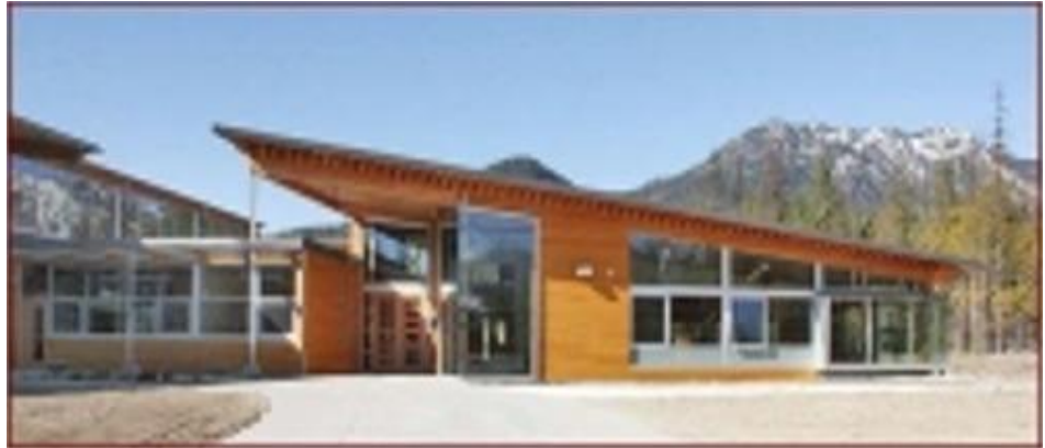
Crawford Bay School

Careful monitoring of the energy consumption of the facilities and tweaking by operations staff create efficiently operated buildings. Recording energy data per facility helps staff quickly note anomalies in energy use and potential mechanical problems.