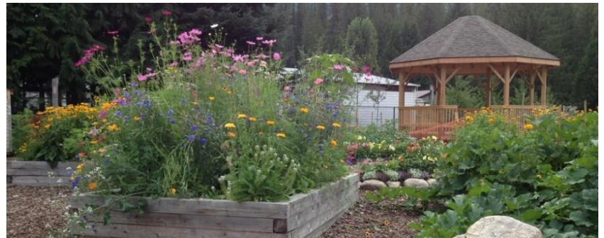
Salmo School Garden (SD8 website)