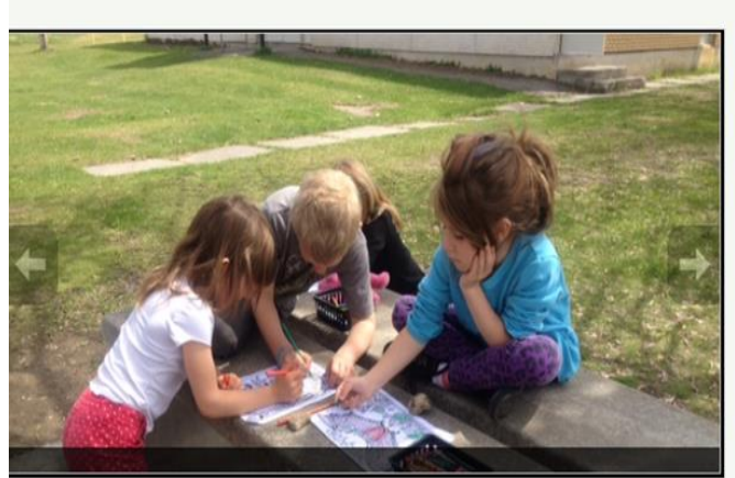
Outdoor Learning

Since 2008, School District 8, as with all School Districts in BC, has prepared a Carbon Neutral Action Report. The report outlines annual projects and actions that our school community, staff, students and volunteers undertake to decrease our carbon footprint and improve our operating practices. Teachers and students in our District are working in their classrooms to incorporate sustainability into the many components of school and community life. We are committed to meeting our GHG emissions reduction target and continue to seek out creative and cost-effective strategies to meet that commitment.