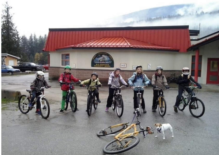
Bikes at School, WE Graham Community School

This Document is based in great part on the 2015 report prepared by the Carbon Neutral Action Committee Members. Thank you to: