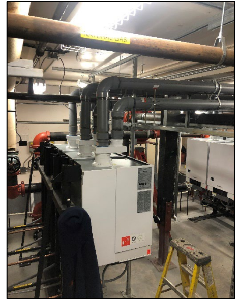
New Efficient Heat Pumps

Bus charging stations have arrived and will be installed this summer.