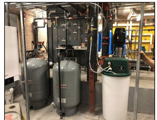
Mount Sentinel Expansion Tanks

The district's "Go Green" Initiative includes low carbon initiatives in all elements of the district's operations including school-based waste reduction and recycling programs.