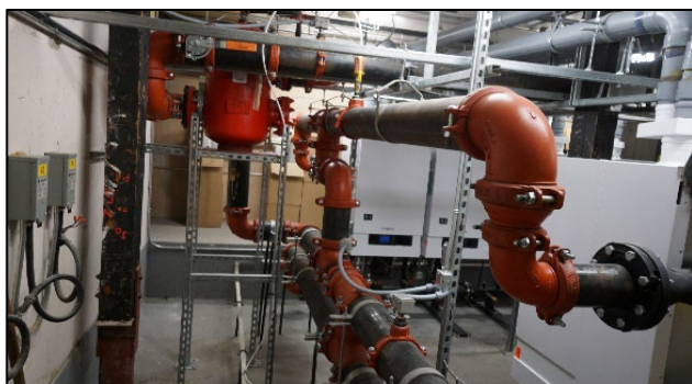
New piping for heating system at Mount Sentinel

The district's paper reduction initiative uses software to count and reduce usage of paper District wide in all employee categories. An employee E-Bike purchase program was implemented. For a full listing of the district's school and departmental Go Green Initiatives, please visit www.sd8.bc.ca/go-green .