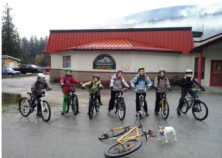
Bikes at School, WE Graham Community School

This Document is based in great part on the 2015 report prepared by the Carbon Neutral Action Committee Members. Thank you to: