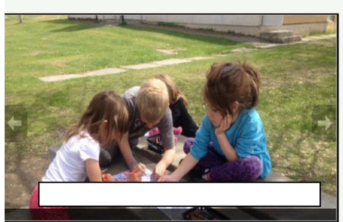
Outdoor Learning (SD8 website)

Since 2008, School District 8, as with all School Districts in BC, has prepared a Carbon Neutral Action Report. The report outlines annual projects and actions that our school community, staff, students and volunteers undertake to decrease our carbon footprint and improve our operating practices. Teachers and students in our District are working in their classrooms to incorporate sustainability into the many components of school and community life. We are committed to meeting our GHG emissions reduction target and continue to seek out creative and cost-effective strategies to meet that commitment.